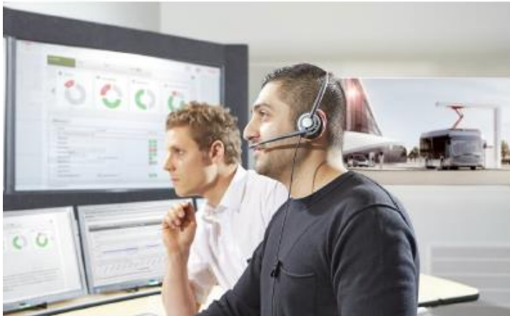
ABB E-mobility electric vehicle chargers are backed by a standard warranty and an experienced service team committed to customer success.

In addition to the standard warranty, our service level agreements (SLA) can optimize charger uptime and support faster remote and on-site response times.